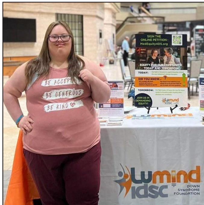
LuMind IDSC at the 2023 NDSS National Conference in Orlando, Florida