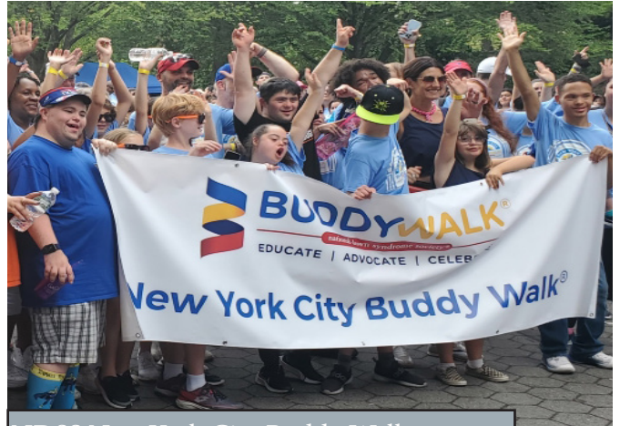
NDSS New York City Buddy Walk