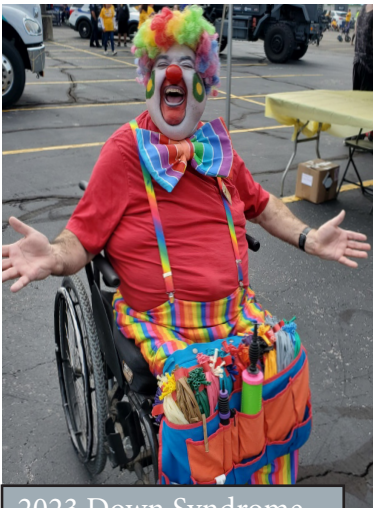
2023 Down Syndrome Association of the Valley Buddy Walk in Ohio