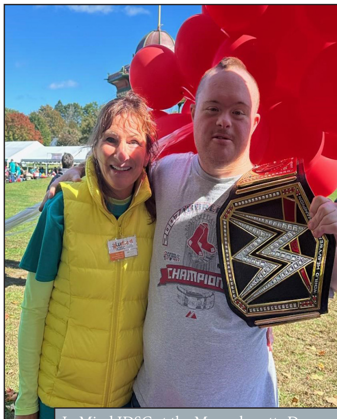
LuMind IDSC at the Massachusetts Down Syndrome Congress (MDSC) Buddy Walk

LIFE DSR BIO, is a biomarkers sub-study of 30 participants that includes brain imaging, blood, and cerebral spinal fluid (CSF) biomarkers. LIFE-DSR BIO was launched in June 2023.