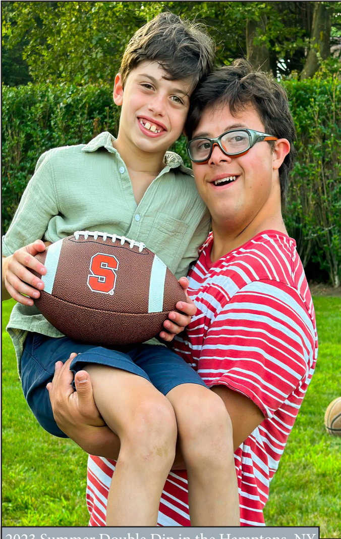
2023 Summer Double Dip in the Hamptons, NY