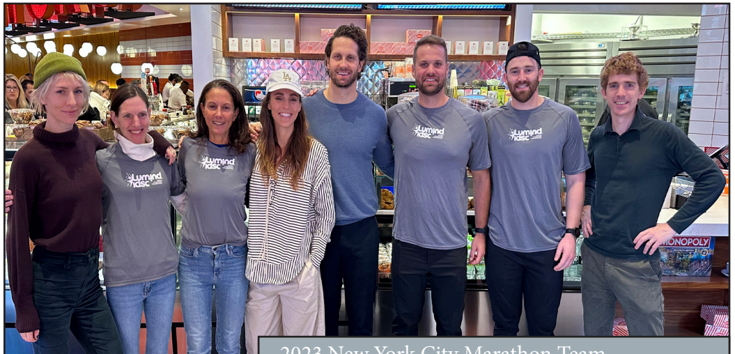
2023 New York City Marathon Team