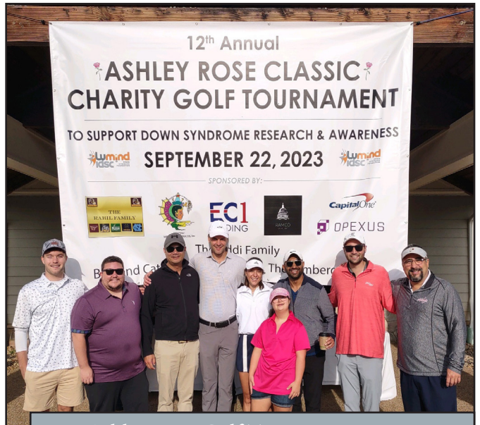
2023 Ashley Rose Golf Tournament in Virginia